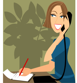
Smile when speaking. People can "hear a smile" over the phone!